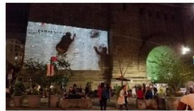
LIGHT YEAR 51- We the People