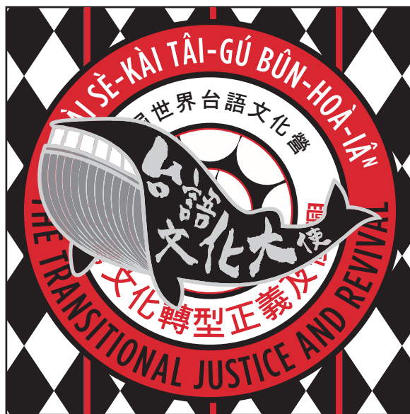
Pin and Card Put together